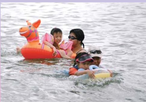
At the beach: fun and exercise for families