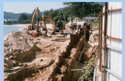
Drainage construction works at Chung Hau