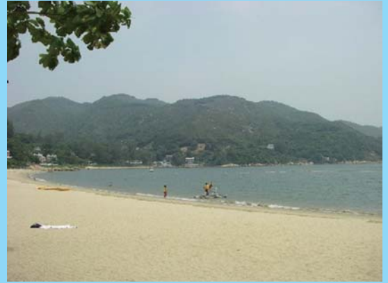
A close-up shot of Silver Mine Bay Beach